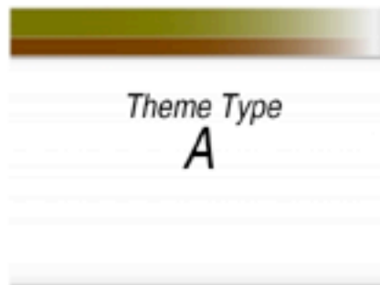
Theme Type A

MyWebBrochure is designed around a basic format. A theme determines how your WebBrochure looks but there are some parts of the WebBrochure that always stay