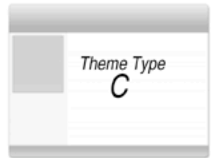
Theme Type C

in the same place. Here are examples of three different themes with the same content. Theme A has a thin top, no frame, left border, and no footer area graphically defined. Theme B has a large top, uses a frame and a gradition of the background to define the left border.