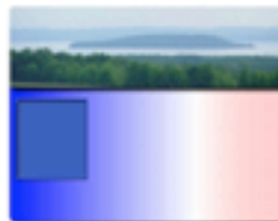
Message: I'm for the environment