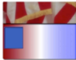
Message: I'm patriotic

To get the maximum interest from repeat viewers use alternates of a theme. In the example of themes below a political candidate might start with a flag theme. Then based on an issue or message alternate the background (red-to-blue, blue-to-red, or change the colors entirely) or they could keep the background and change the frames, or change just the picture at the top.