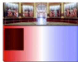
Message: I want to be in the Capitol